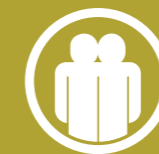
Bespoke care packages