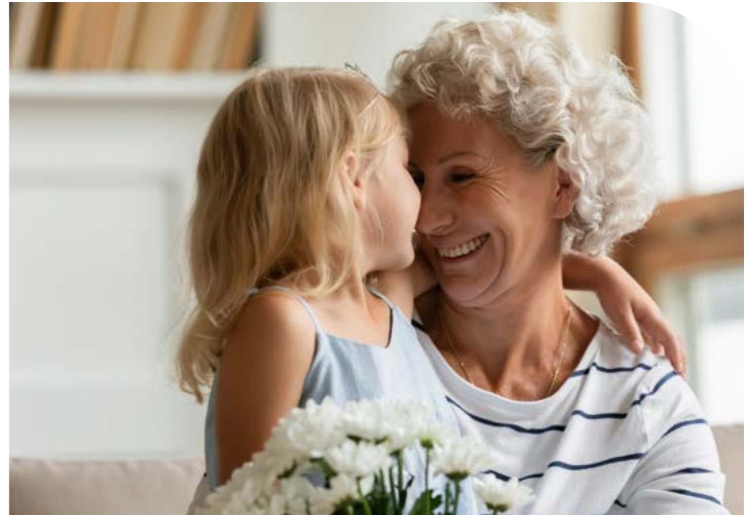
New home, new adventures, new memories