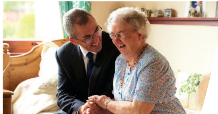
Resident and Chaplain chatting

As part of MHA's desire to offer the very best in later life, we also provide additional therapies such as reflexology for your well-being. These gentle one-to-one sessions aim to bring calm and relaxation.