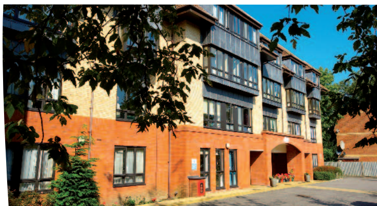
Lawnfield House, Willesden, London NW2