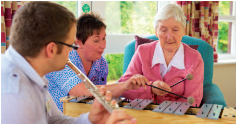
Resident participating in a music therapy session

We take pride in the cleanliness and maintenance of your home and provide a thorough and friendly cleaning service. Your personal washing will be carefully laundered and returned to you, clean and fresh.