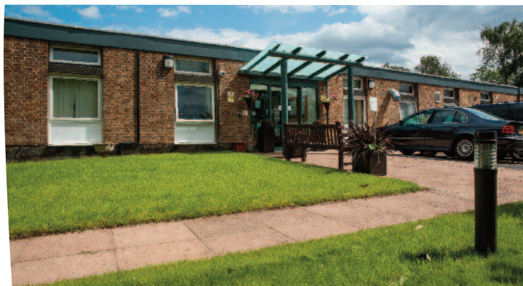
Kenbrook, Wembley Park, Middlesex

In the words of one staff member, "There is a very nice environment in the home and it's a warm and homely place for residents to live. We welcome all older people with open arms, from different kinds of backgrounds, that are in need of the care we provide. It's a place where people can truly feel at home."