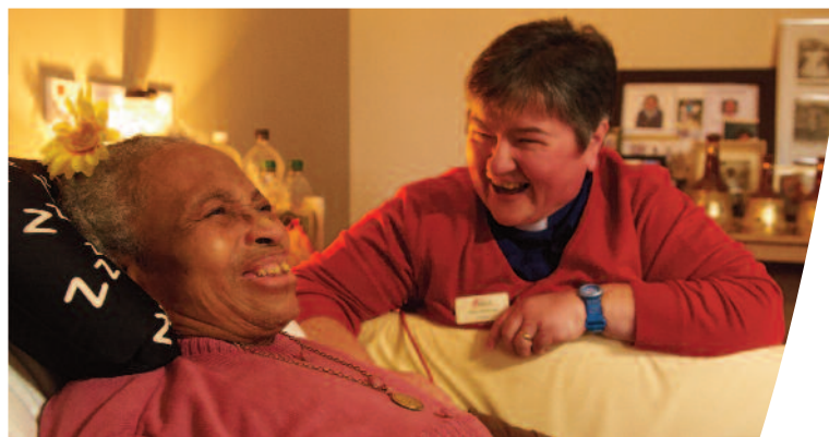
Resident and Chaplain chatting

As part of MHA's desire to offer the very best in later life, we also provide additional therapies such as reflexology for your well-being. These gentle one-to-one sessions aim to bring calm and relaxation.