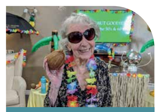
Glen Rosa care home Hawaiian Day

Glen Rosa care home hosted a 'Hawaiian Day' for residents, complete with songs, dancing and lots of props!