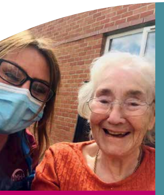
Selfie at Waterside House care home

In all images national and local guidelines were adhered to and PPE was worn correctly at time of taking.